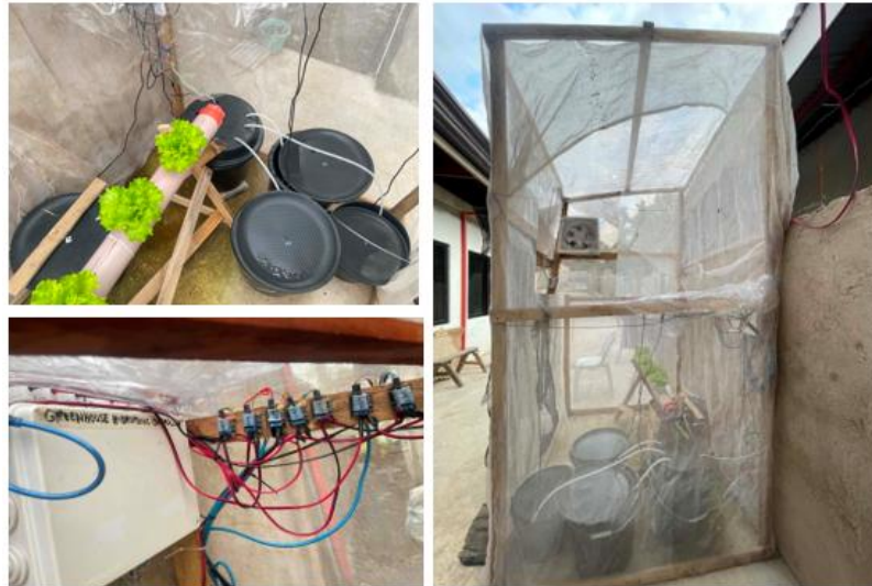
Figure 1 shows the developed hydroponic system prototype consisting of sensors, an ESP32 microcontroller, Arduino Uno, relay modules, nutrient reservoir, exhaust fan, misting system, and hydroponic growing channels. The prototype was designed to automate environmental monitoring and nutrient management for lettuce cultivation.

Developed IoT-Based Automated Hydroponic System Prototype