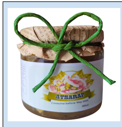
Figure 2. The Appropriate Packaging Material Utilized in Preparing Pickled Watermelon Rind

The packaging used for watermelon rind pickles was a 150ml jar. Included in the packaging were the logo, list of ingredients, nutritional content as well as the expiration date.